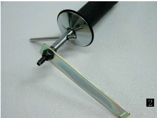
2 Put the tools like this, referring to image 2.