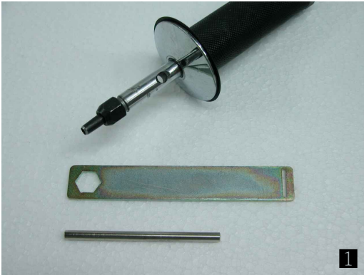
1 Prepare tools, referring to left image 1,