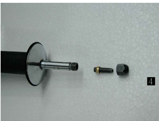
4 After releasing bolt, now you can replace punch blade with as you want. Please watch out the direction of "CORK".