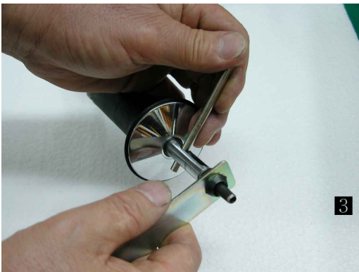
3 Fix left handle by hand and then turn wrench plate by counter clock wise to release the punch blade.